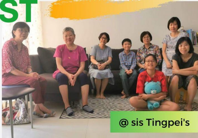
@ sis Tingpei's