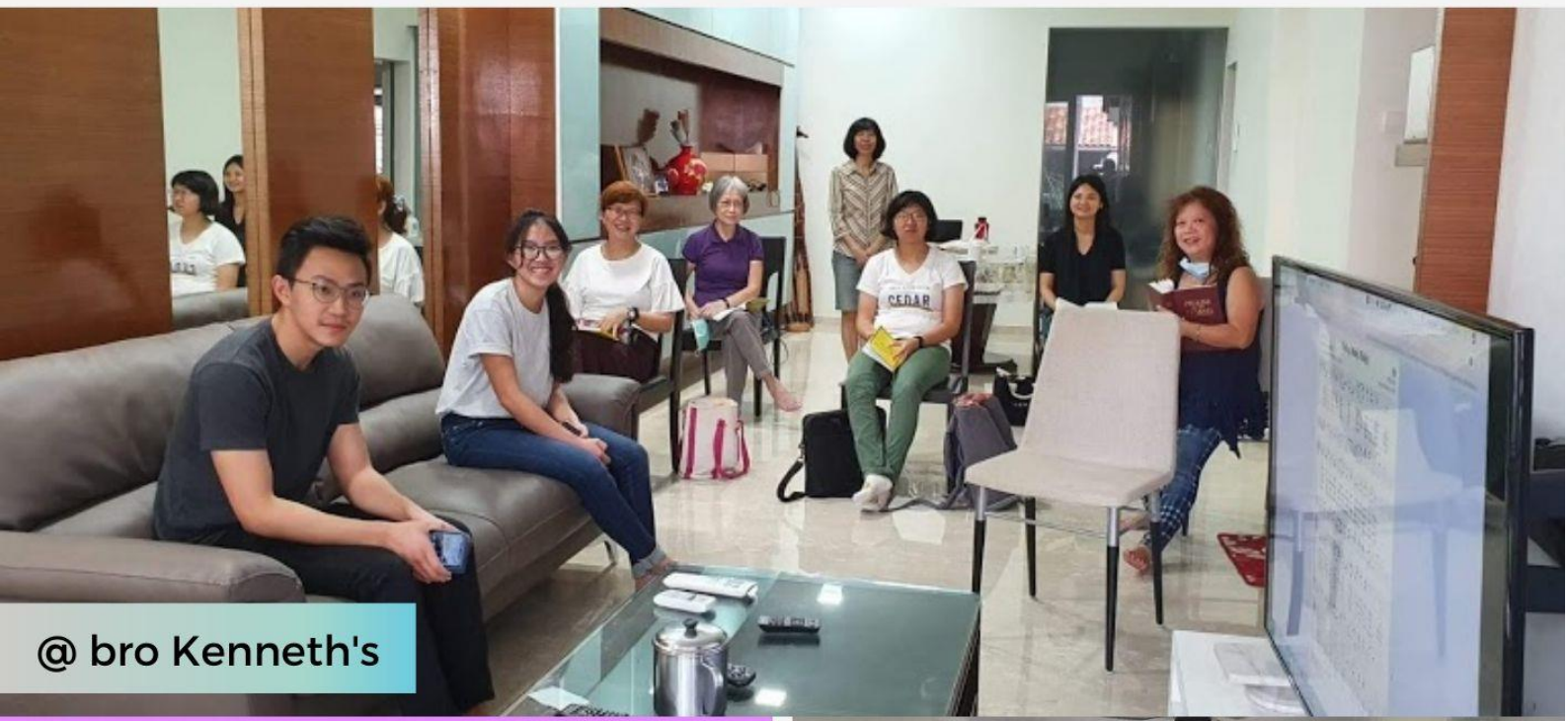
@ bro Kenneth's