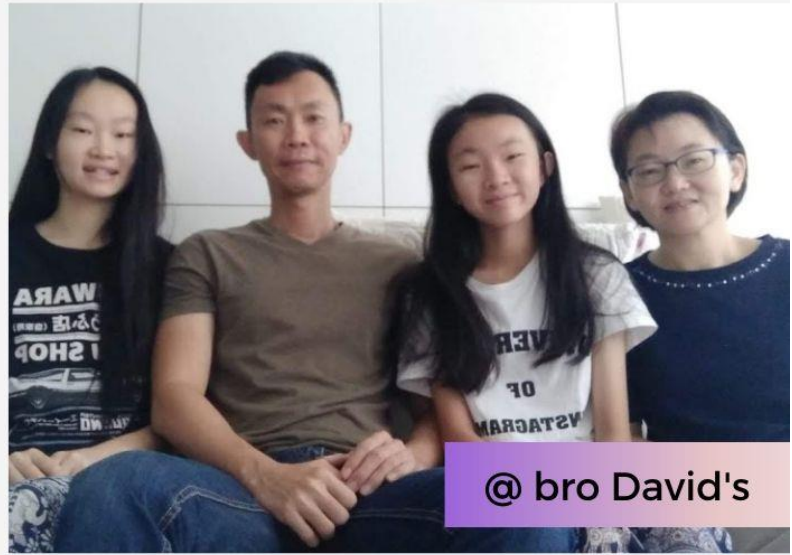
@ bro David's