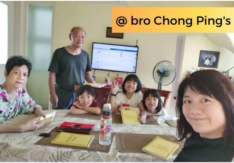
@ bro Chong Ping's