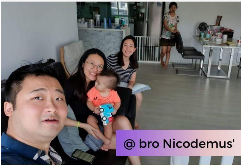
@ bro Nicodemus'