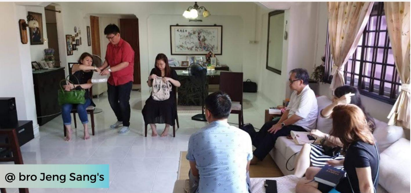
@ bro Jeng Sang's