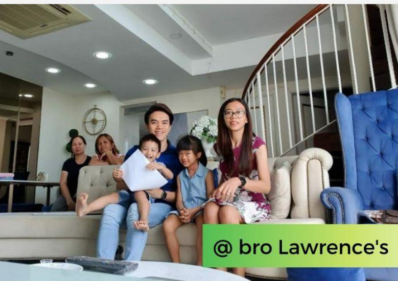
@ bro Lawrence's