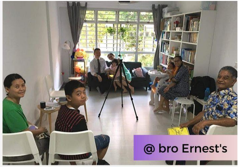
@ bro Ernest's